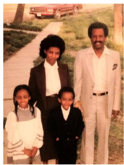
grew up in the Midwest-in Peoria and Oak Park, Illinois, where he experienced the "indelible mark" of racism, marginalization, and outsider status. "Not African American or black enough for some" but called a "n--- to his face" by white students, Mengestu experienced isolation and bigotry. Books became a way to escape and make sense of the world he

http://www.neabigread.org/books/beautifulthings/readersguide/about-the-author/#RedTerror